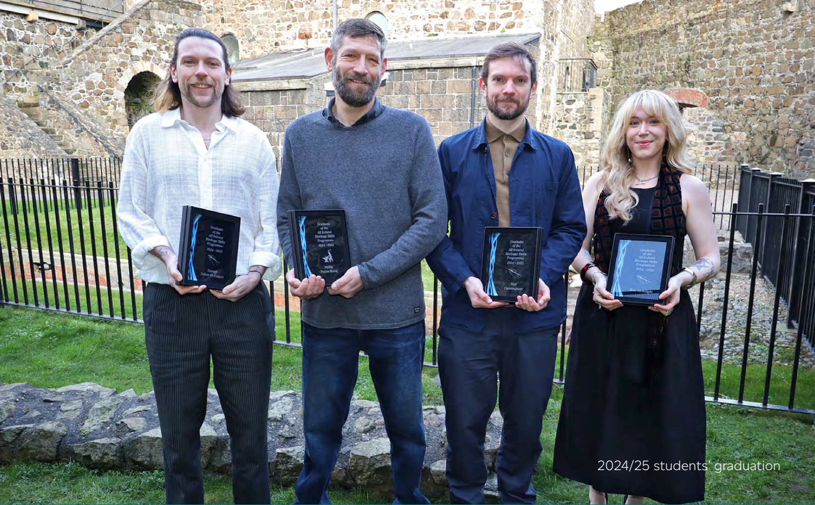
2024/25 students' graduation