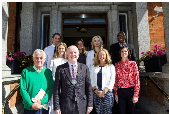
Photograph 1: Monaghan County Council welcomes the Heritage Council and the ATCM 10

https://www.heritagecouncil.ie/content/files/Workshop_pack_town_centre_health_check_naas.pdf