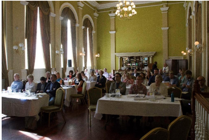
Photograph 3: Border Town Workshop participants listen to Session 1 presentations

Issues raised in the lively Q&A (Session 1) were as follows – Questions from the floor in bold – response from speaker in normal font: