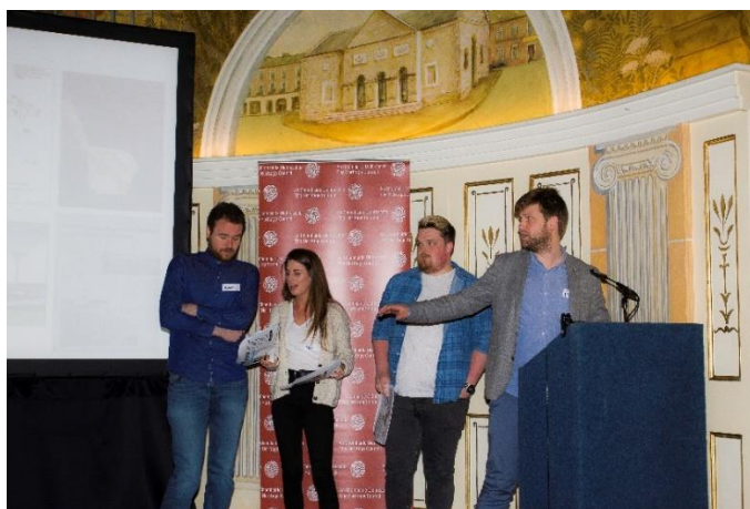
Photograph 6: QUB (Lecturer and Students) present on Letterkenny Town Centre

87% of commercial operators and retailers surveyed noticed a decrease in cross-border trading since the announcement of Brexit.