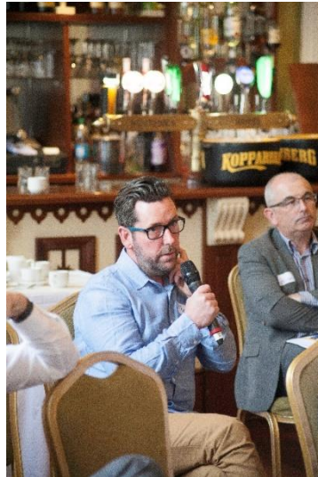
Photograph 11: Cavan County Council takes part in the Q&A session