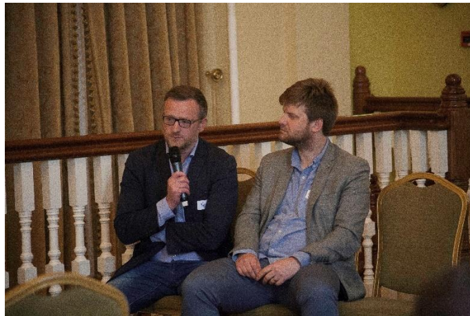
Photograph 8: Representatives from Louth County Council and Monaghan County Council take part in the Q&A session