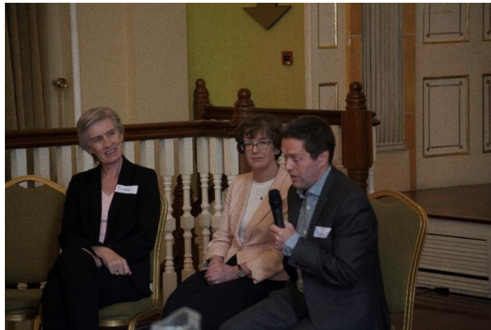
Photograph 5: Heritage Council facilitating the workshop