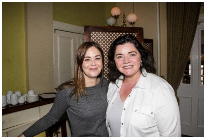
Photograph 12: Louth County Council takes part in the Q&A session