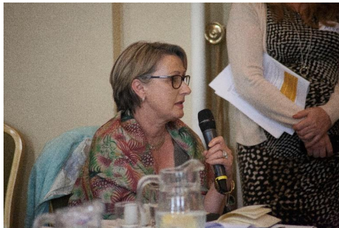
Photograph 9: Sligo BID’s CEO takes part in the Q&A session