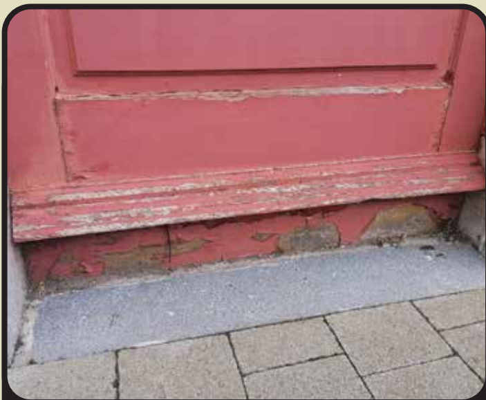
Lack of paint, particularly at the base of doors and windows allows timber to become saturated and degraded.

Any wood or metal on the outside of your building needs to be protected from the weather to stop rot and corrosion. Outdoor wood and metal should be repainted at least every five years. Nonetheless, you should check for signs of cracking or peeling paint every year.