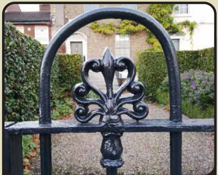
Regularly painting your railings is the most cost-effective way of protecting wrought and cast ironwork. They will continue to last generations.