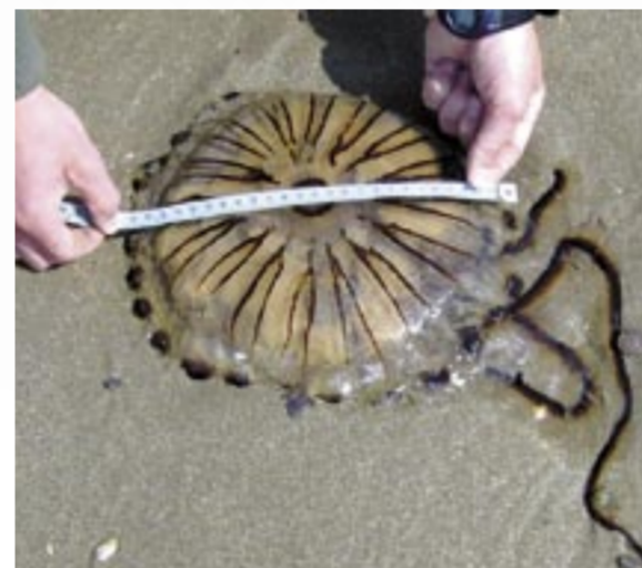
Compass jellyfish. (Ailish Murphy)

Barrel jellyfish stranded on a beach in Rosslare - Unlike all the other Irish jellyfish, the Barrel jellyfish has no tentacles. The cauliflower looking bit underneath the bell is made of eight branches, each one called an 'oral arm'. As the name implies, they are feeding structures, with thousands of tiny holes (or mouths) that suck up their plankton food. These jellyfish can weigh as much as 30 kg! (Chris Wilson)