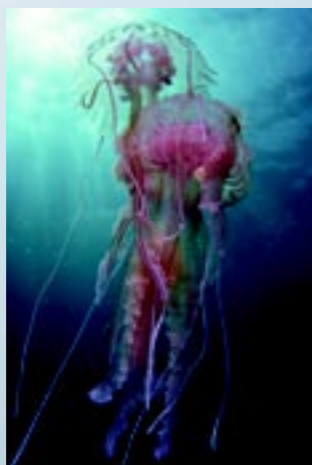
Pelagia noctiluca is an oceanic species and only occasionally makes an appearance in Irish coastal waters. It does not have a benthic stage (so no polyps) and spends its entire life swimming and reproducing in the water column.

The polyp is shaped like a minuscule vase (a few millimetres in height) with tiny tentacles attached around the rim. It looks something like a tiny sea anemone. It normally attaches to rocky substrates or shells in shallow coastal environments, and can live for many years. Importantly, the polyp produces the adult jellyfish (see life cycle figure on centre page).