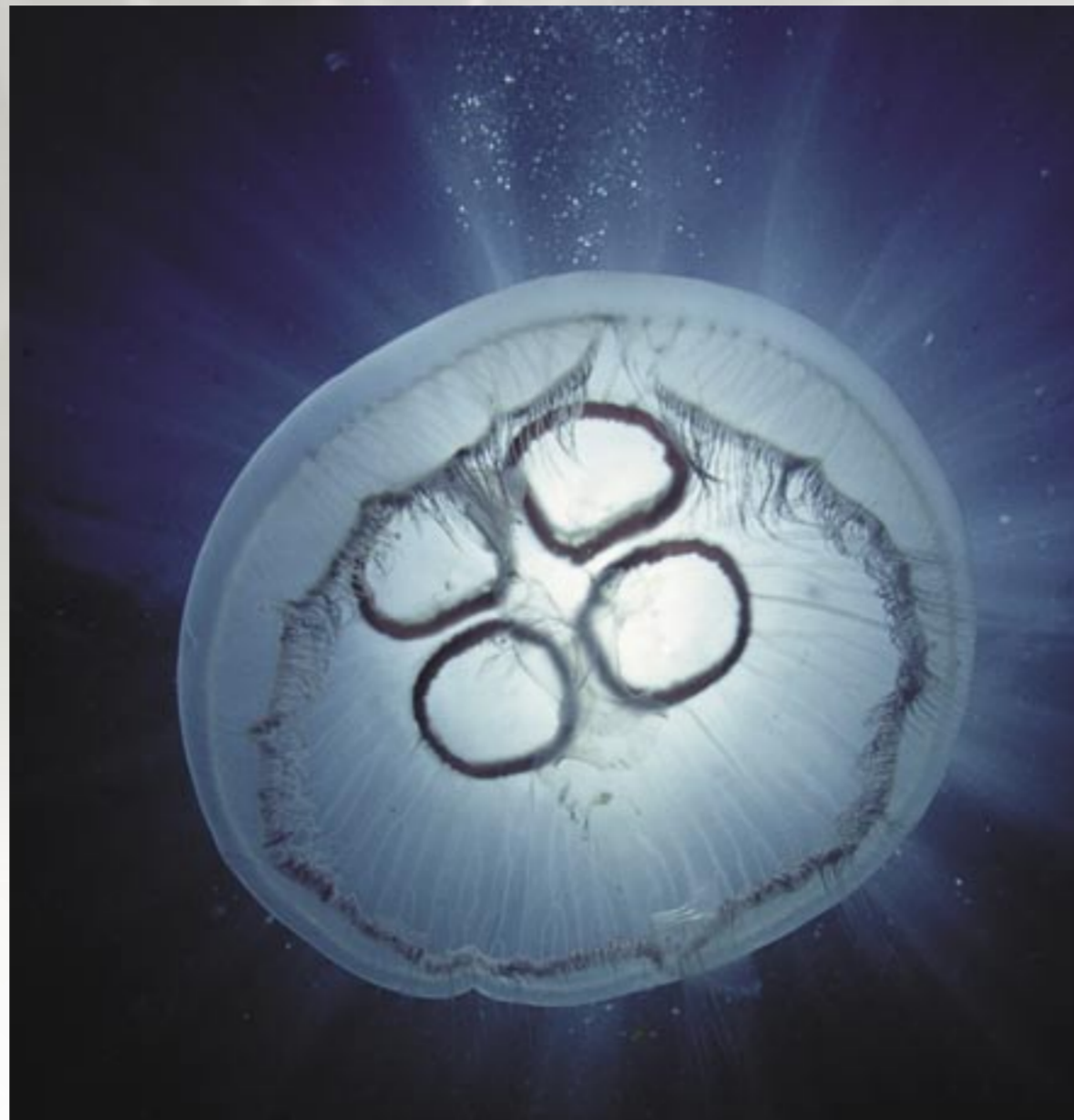
Common (moon) jellyfish.

A stinging cell is like a tiny balloon with a miniature harpoon coiled up inside it. When the balloon bursts upon contact with an object, the harpoon is fired and injects venom into an unsuspecting animal (or person). Luckily for us, our skin forms quite an effective barrier against most of these 'harpoon' attacks. For example, the stinging cells of the Common jellyfish rarely break our skin and so have no effect. However, all stinging cells are strong enough to sting the more delicate tissues of our body such as eyes and lips. Some jellyfish, most notably the Lion's Mane, possess stinging cells that are much sharper and have no problem piercing our tough skin. The Lion's Mane jellyfish is Ireland's most venomous jellyfish.