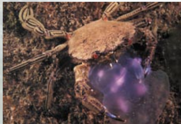
Crab eating jellyfish. Many jellyfish wash up on our beaches whereas others fall to the sea floor where opportunistic crabs such as this Velvet Swimming Crab may eat them.

They are composed almost entirely of water (up to 96%) and use the muscles of their body wall to push against this fluid inside to create a pulsating swimming movement. The adult jellyfish or the medusa is typically bell or dome-shaped, very large, short lived (months rather than years), and swims. However, jellyfish are also present all year round in another form – the polyp.