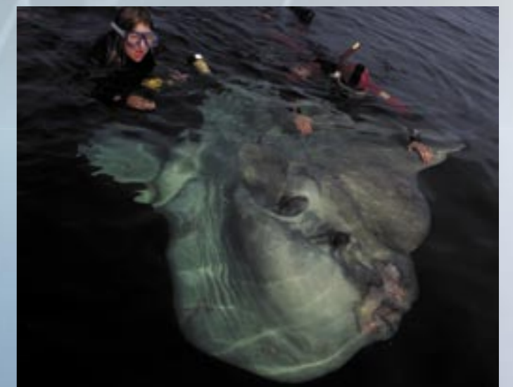
Sunfish in Tralee Bay - Sunfish are the largest bony fish in the world, at times measuring over 3 m in length and weighing up 2235 kg (2 tonnes). Each summer they visit our waters to feed on our many types of jellyfish.