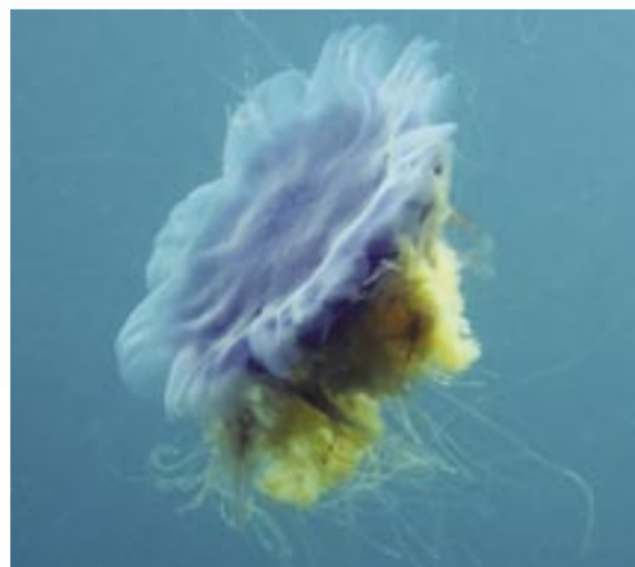
Blue jellyfish. (Matthew Slightam)