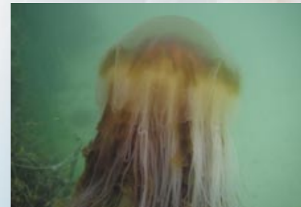
The Lion's Mane jellyfish has hundreds of tentacles that at times stretch out so finely that they become almost invisible to the unsuspecting swimmer or fish! Here the tentacles are in the contracted state and are as thick as a shoelace. (Patricia Byrne)