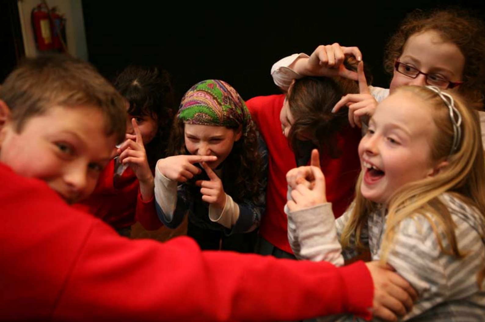
Barnstorm Theatre Company.