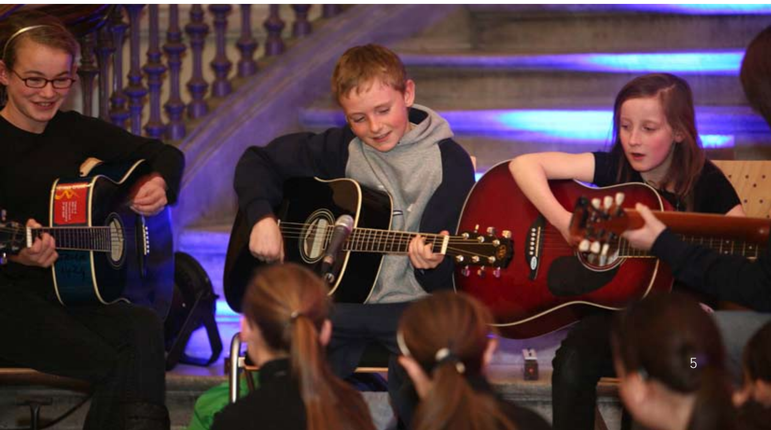
Common Ground.

No. There is no legal constraint on taking images of children or young people in public settings. However, photographs or images are defined as data and therefore come within the scope of the Data Protection Acts 1998/2003.