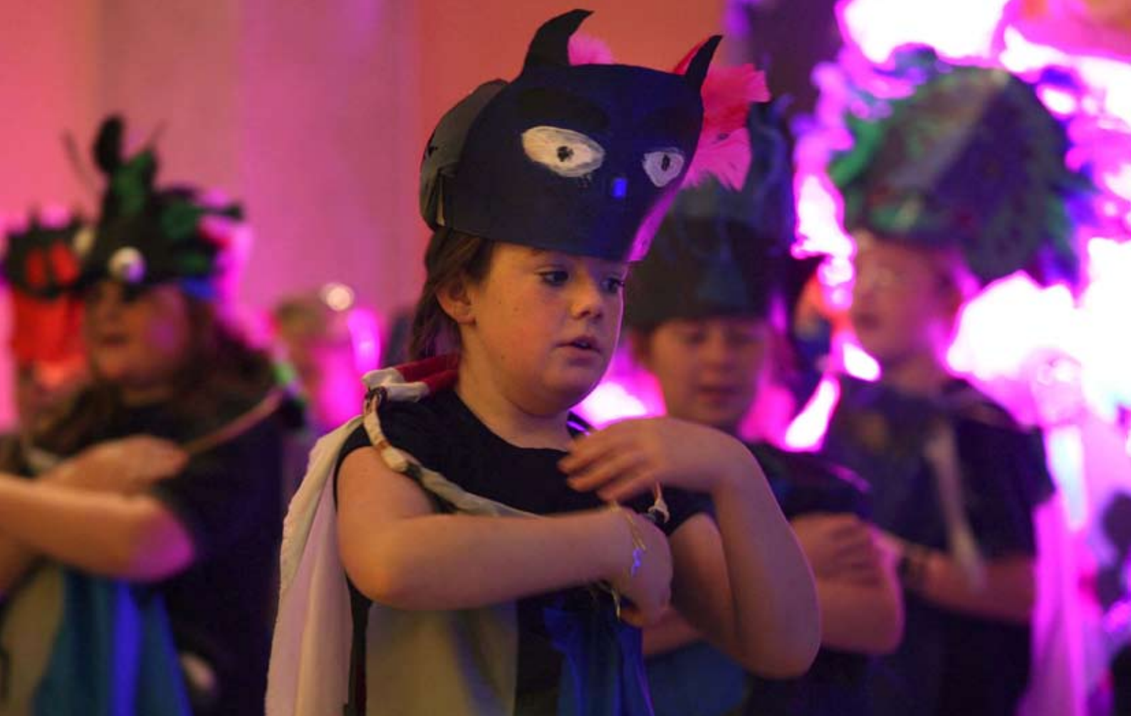
Common Ground.