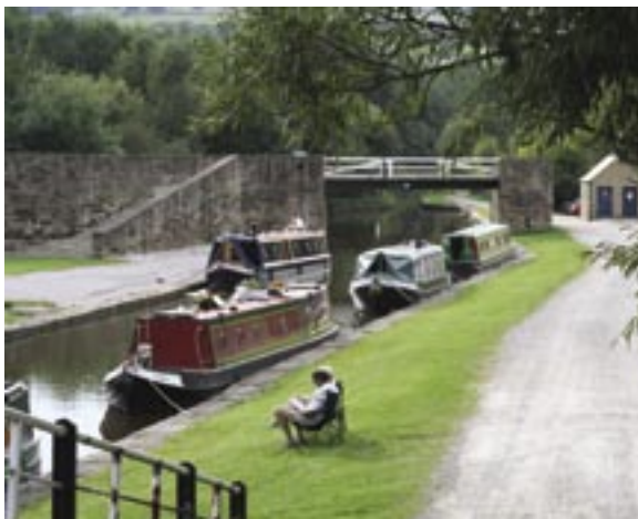
Bugsworth Basin on the Peak Forest Canal, Derbyshire

I think the important thing is that canals are very positive in terms of their economic impact on the areas through which they pass, and also at a wider level right throughout society. As I mentioned, the towpath impact of this is very difficult to disentangle in economic terms, and I think we need to look at it from the holistic point of view of overall canal management. I think the key point is that the importance of canals has been undoubtedly proved by all the research that's been done over the years. Thank you.