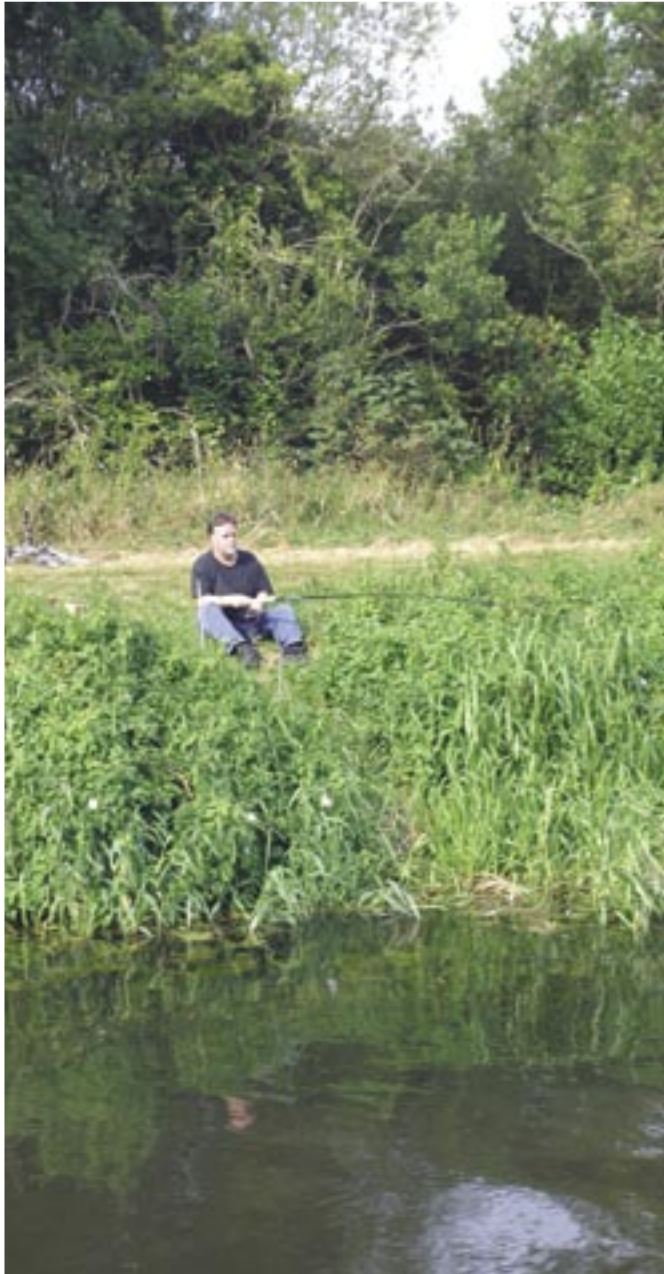
Angling along the Barrow

interpretive signage on the 1,000 kilometres of waterways that we manage. This is just one example of the future investment by Waterways Ireland in the waterway product. At the same time Waterways Ireland will continue to develop the towpath infrastructure with the relevant tourism bodies, the relevant state and local authorities, as well as the private sector. However this development must be managed in a balanced and sustainable manner, taking into account the urban and rural landscapes that the towpaths traverse. All in all, the future for Ireland's towpaths is more secure than ever before as Waterways Ireland continues to hold the waterways in trust for the people of Ireland. Thanks very much.