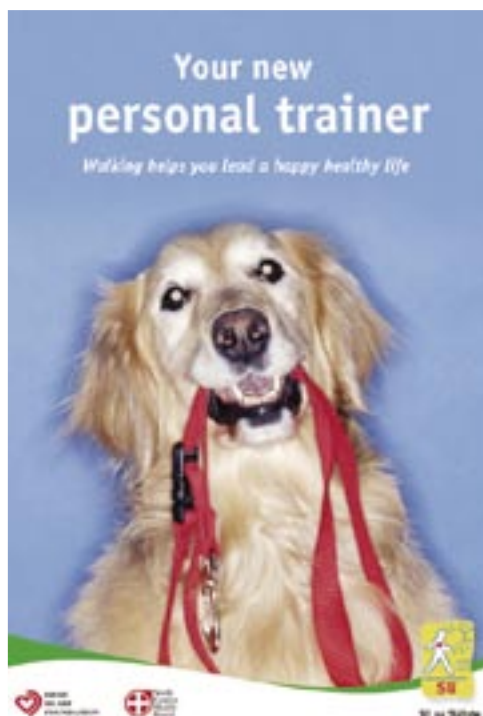
An Irish Heart Foundation advertisement showing dog-walking as a path to health