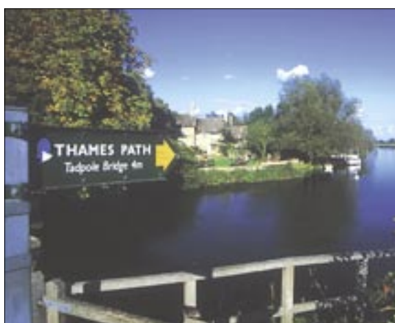
Clear signage on the Thames Path