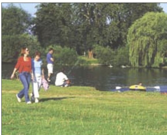
The Thames Navigation shows a variety of usage