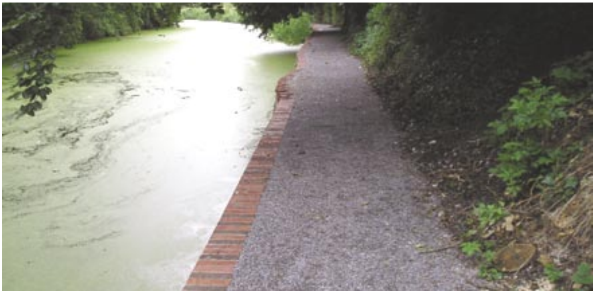
A completed towpath