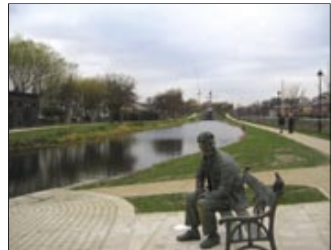
The towpath along the Royal Canal at Binns Bridge