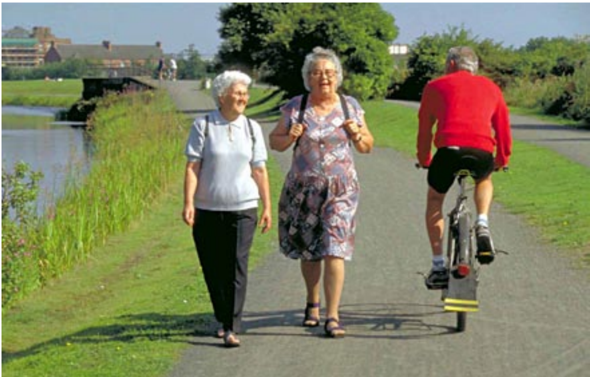
Cyclist and walkers happily coexist on a suitable section of towpath

I think that there is a great opportunity in the Republic. I think we're becoming an unhealthier nation, I think kids have less access to the countryside but people have more time because they're living longer. I also think that there are great opportunities for tourism. If Sustrans can in any way help you and offer constructive advice, we would be only too pleased to do so. Thank you.