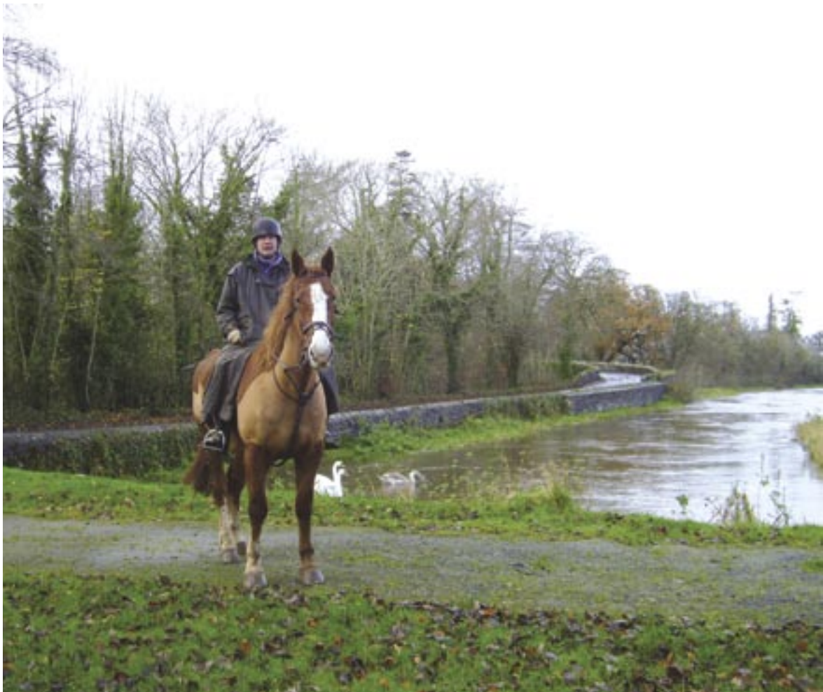
Horse riding on towpaths need not be incompatible with other usage

Teamwork is one of the biggest things in Scotland that makes the legislation work. The local councils, National Park Authorities, recreational users, Ramblers Association, Cycling Scotland, Sustrans, Cyclists' Touring Club, we all work together. We communicate, we network, and we consult. I think if you are half way there with that, this is not going to be such a big issue anywhere in the world. Thank you for your time.