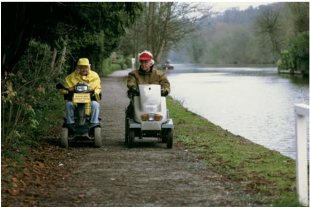
Riverside wheelchair usage