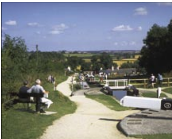
The Grand Union Canal at Foxton Locks, Leicestershire