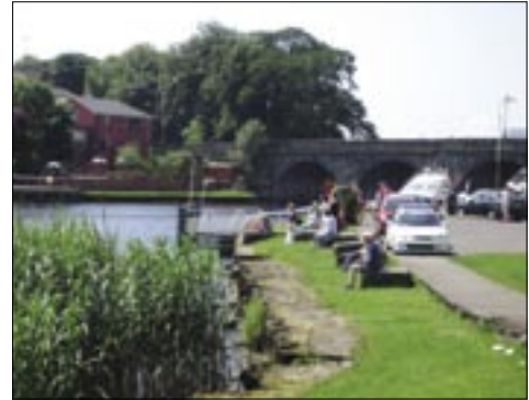
The towpath at Carrick-on-Shannon