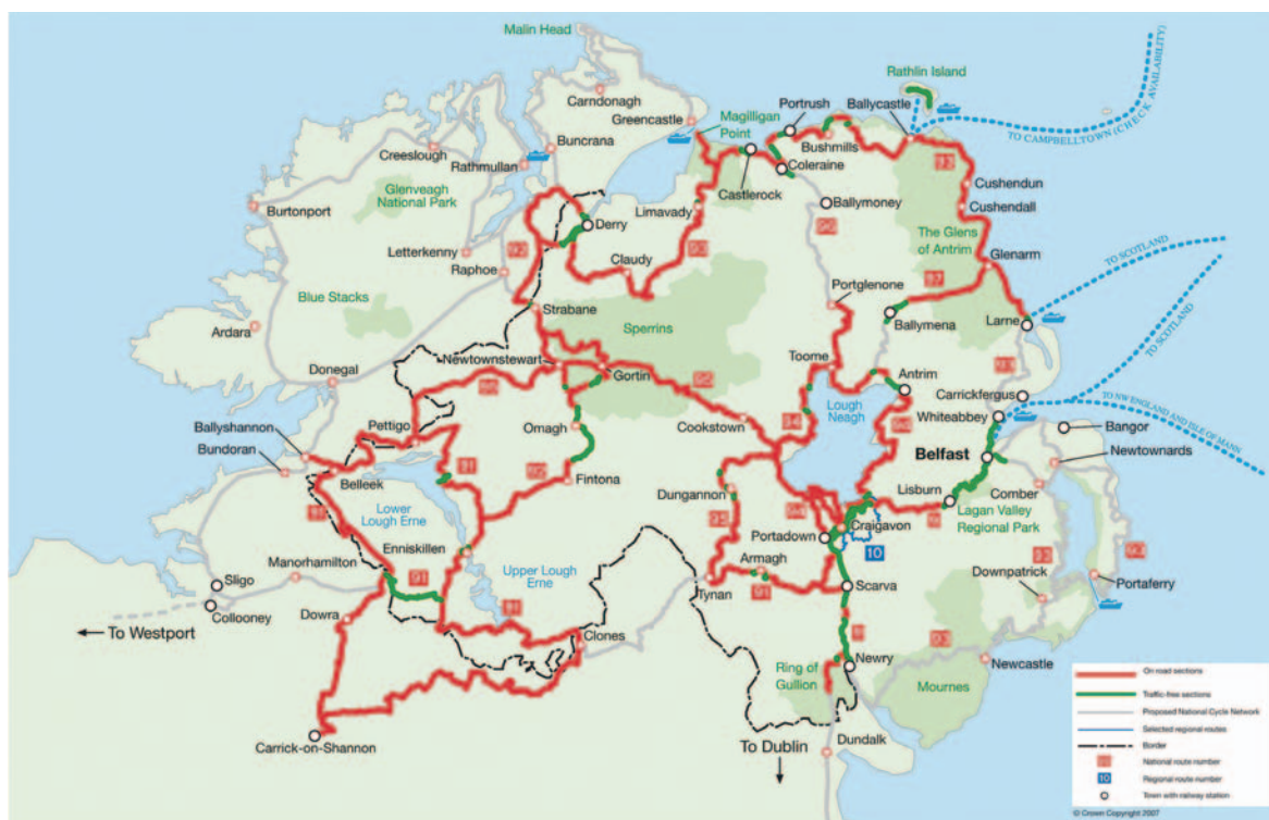
The National cycle network in Northern Ireland and the border counties