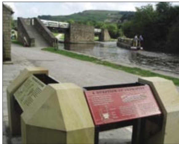
Bugsworth Basin, showing recently-installed interpretation panels