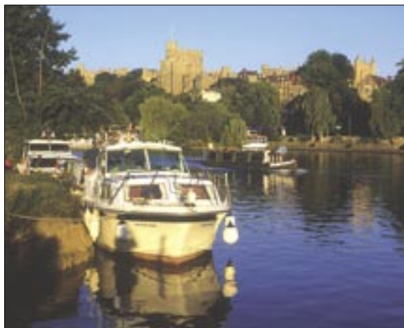
Boats on the Thames Navigation at Windsor Castle