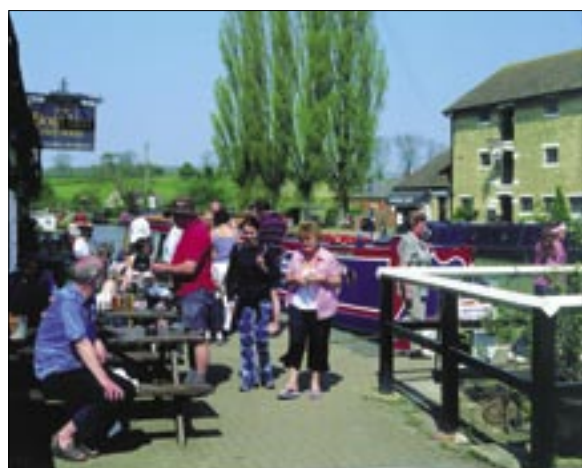
The canal-side village of Stoke Bruerne on the Grand Union Canal, Northamptonshire