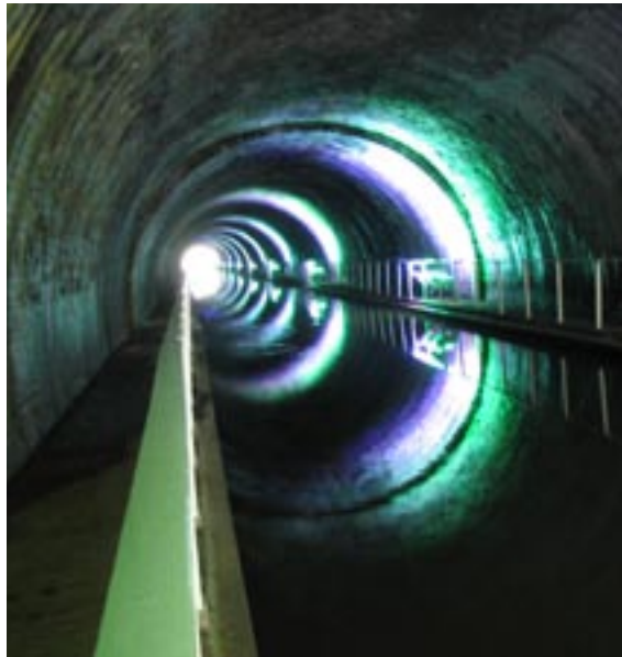
The lighting project at Newbold Tunnel, Rugby