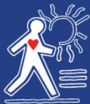
A map of Slí na Sláinte – Nenagh © The Irish Heart Foundation

NENAGH UDC NORTH TIPPERARY SPORTS PARTNERSHIP NORTH TIPPERARY COUNTY COUNCIL