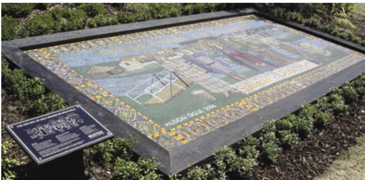
Mosaic artwork along the canal at Vines Park, created by local school children