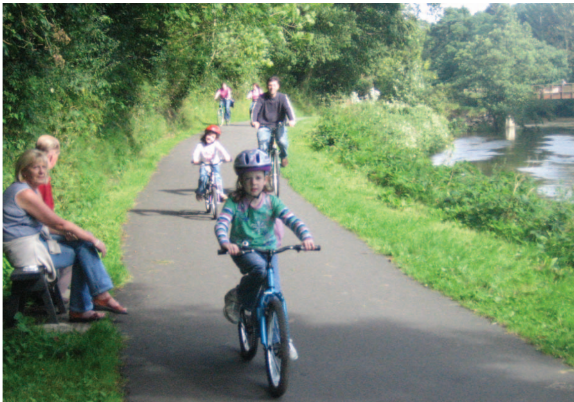
Mixed usage on the Lagan Towpath