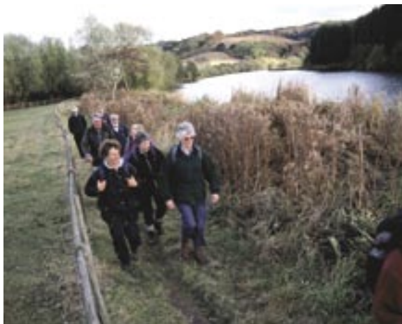
Walkers on the Thames Path

and think 'oh there it is' and go away and leave it. I have a member of staff who spends most of their time just keeping in touch with people, cajoling them and getting them involved. We have to respond to customer issues quickly as a navigation authority, and there are always issues to work on. Thank you very much.