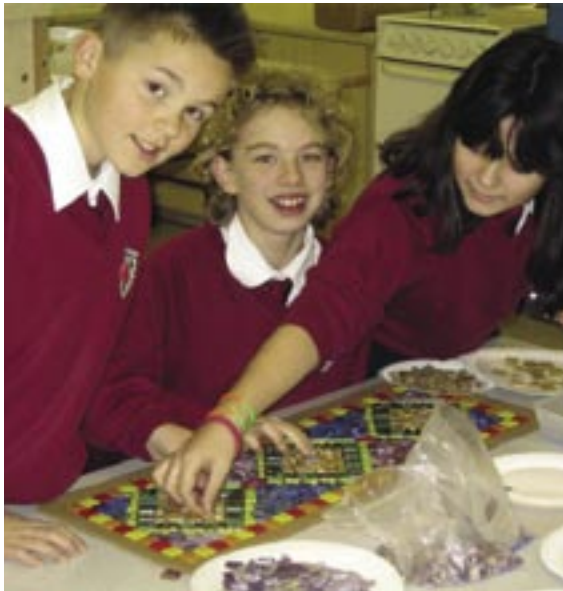
School children work on the mosaic project for Vines Park