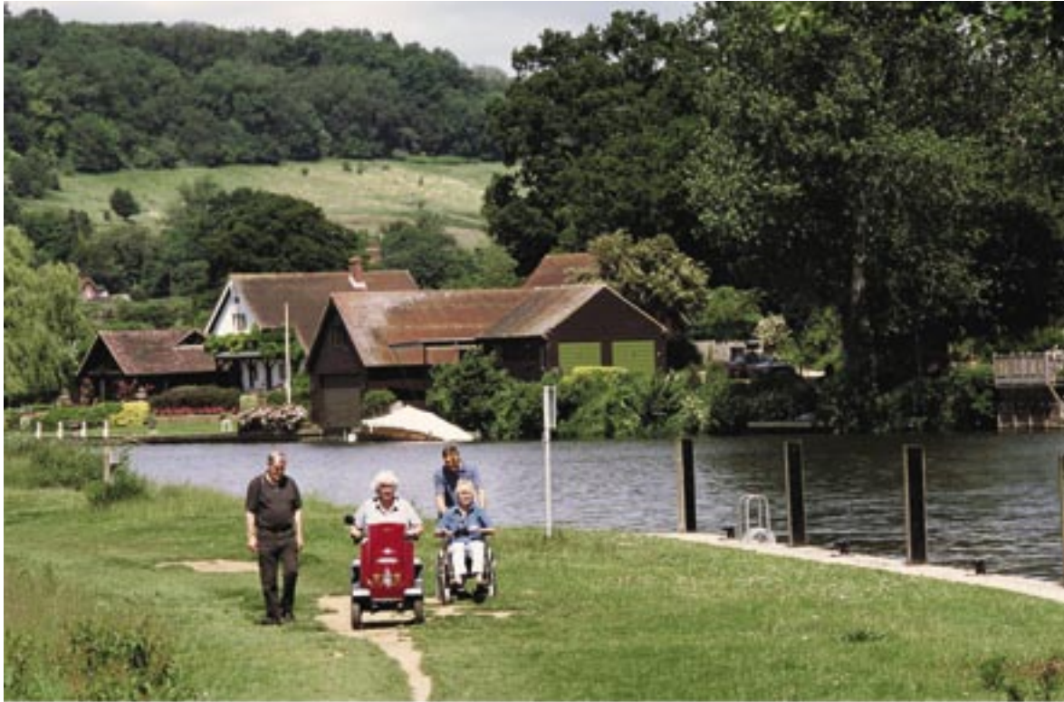
Access for all on the Thames Path, UK