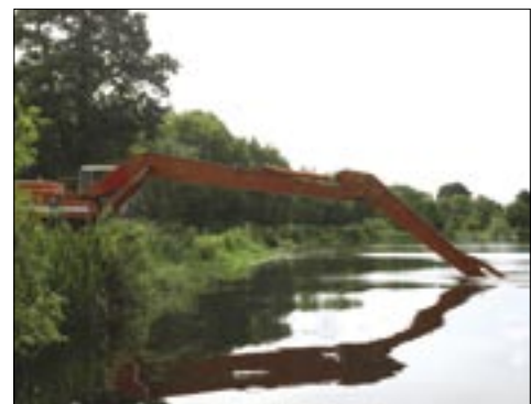
Using the towpath for canal maintenance