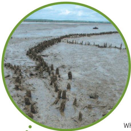
Late medieval fishtrap on the Shannon Estuary. Sites such as these will be very vulnerable to rises in sea level and the change in sediment movement.