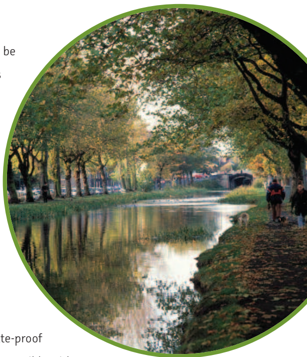
Grand Canal, Dublin. With a greater frequency of extreme rain events, and prolonged drought periods, the management of water levels on the canals and inland waterways will become more complex and important.

The costs, financial and otherwise, of protecting our heritage and tourism resources need to be placed against the feasibility of undertaking this work. Priorities will have to be identified and trade-offs made on what to protect and conserve, and what to let go, based on high quality information on the significance of the heritage resource, alongside the values that each holds for the community.