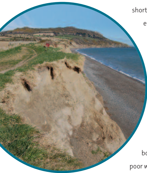
Erosion of the cliffs north of Greystones. The location of coastal paths must be considered carefully in the light of increasing rates of coastal erosion.

However, it's not all bad news for tourism. For example, climate change can bring with it a number of opportunities which operators can capitalise upon, and others which we may not even be able to foresee at this time. A case in point is nature-based tourism, which is likely to see both positive and negative impacts from climate change.