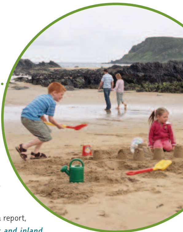
Some of Ireland's much visited beaches may disappear as sea levels rise.

The main report should be consulted for further details on all the issues covered in this summary document.