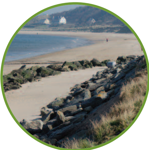
Coastal defences for North West Golf Course. Many golf courses currently experiencing coastal erosion problems which will be further exacerbated by climate change.