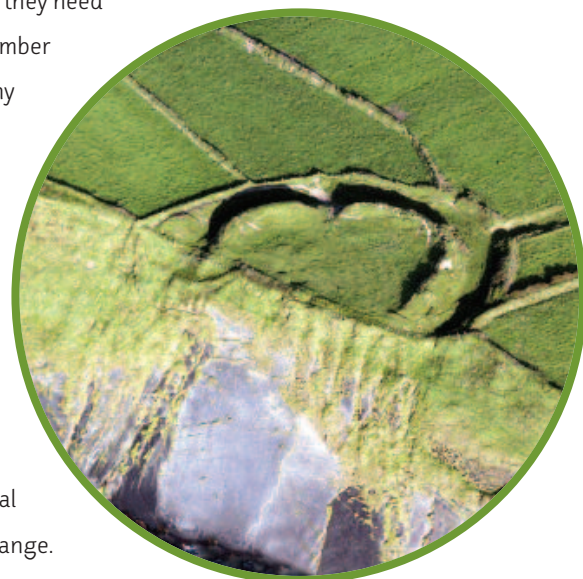
Doon West ringfort in Co Kerry offers a very spectacular example of coastal erosion.

This need for integration reflects the necessity for a more cohesive management approach at an institutional level. In particular, the development of a national policy on Integrated Coastal Zone Management is critical in devising a coherent, appropriate response to rising sea levels and coastal erosion. The Water Framework Directive and the OPW flooding guidance are steps towards a more joined-up approach which should be used to inform other areas of national policy.