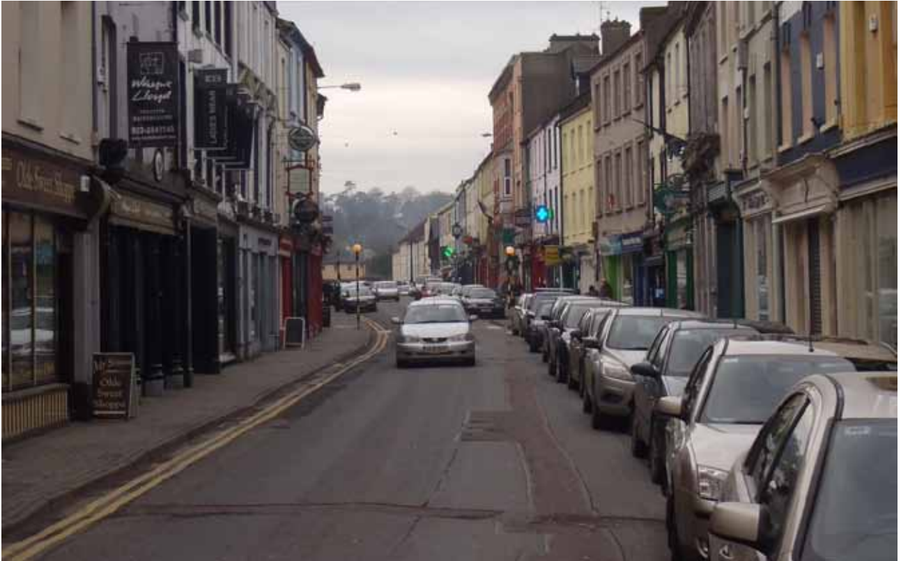
South Main Street