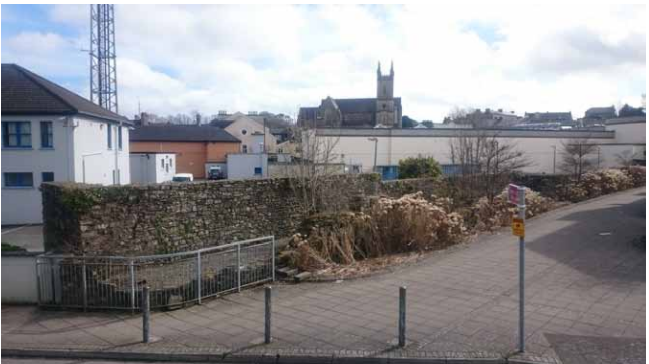
Section of 17 th Century town wall leading to SuperValu