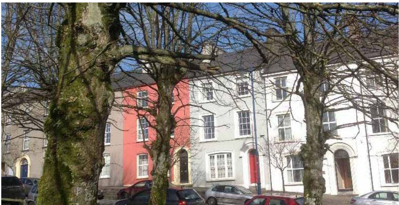
Figure 5.1 Georgian houses on Kilbrogan Hill

The group identified the beautiful architecture in the area, particularly the Georgian houses with impressive arched doorways, almost all of which are mostly intact (figure 5.1). It was noted that most houses have changed to PVC windows. Two houses still have the original wooden sliding sash windows. Many doorways have limestone steps with shoe scrapers. The group identified the importance of conservation both here and throughout the town.