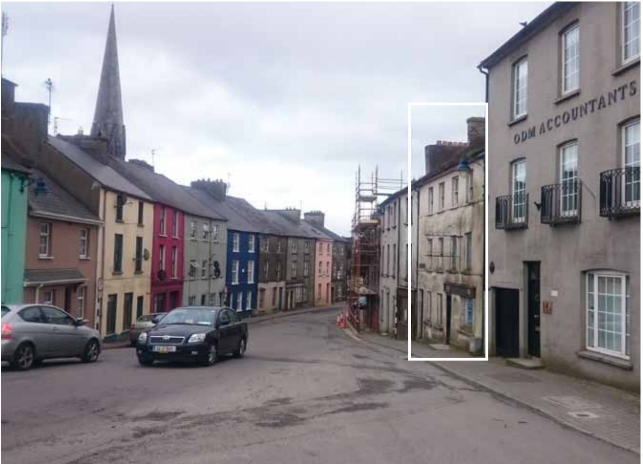
17 th Century house located behind later facade