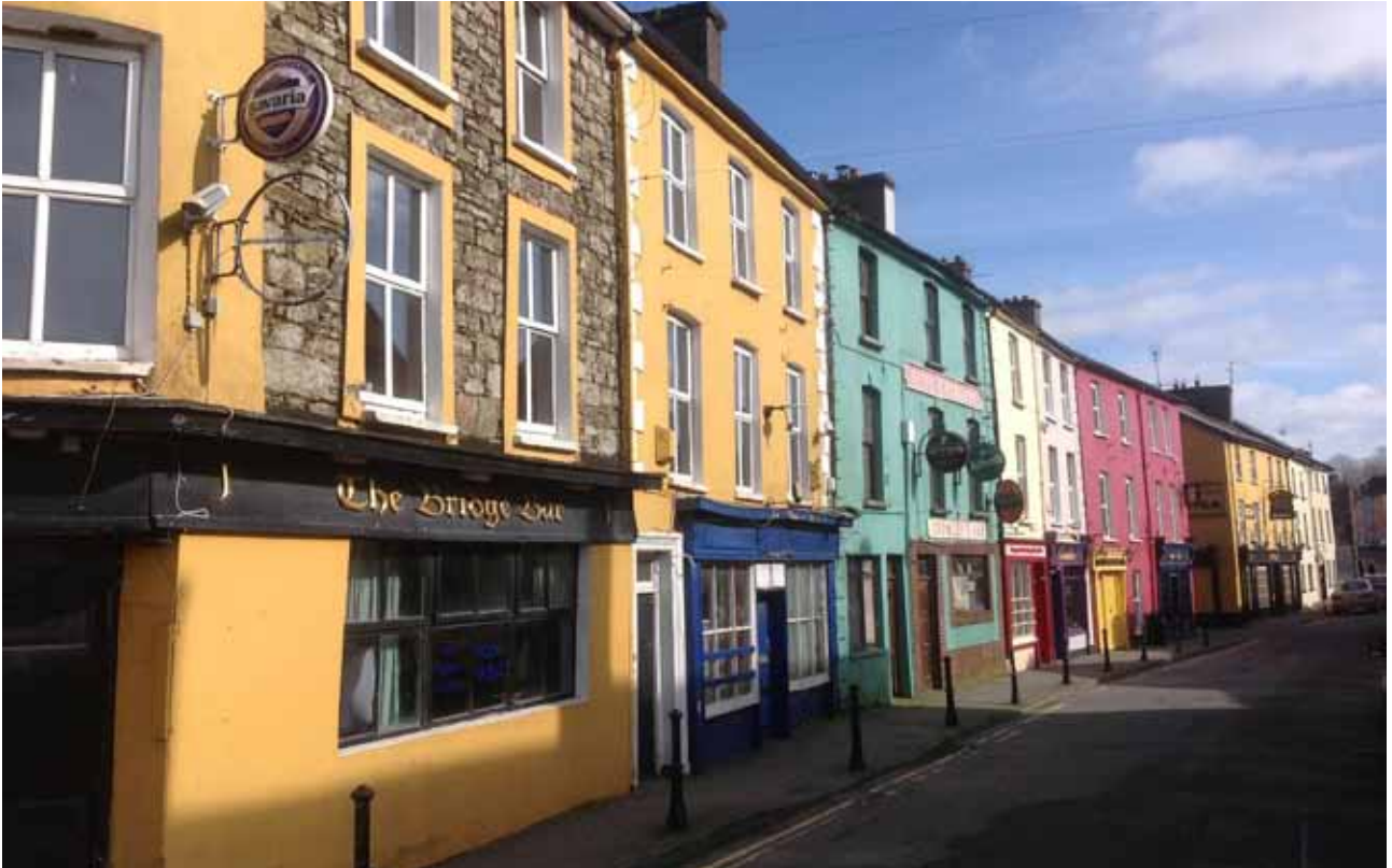
Shopfronts on Oliver Plunkett Street