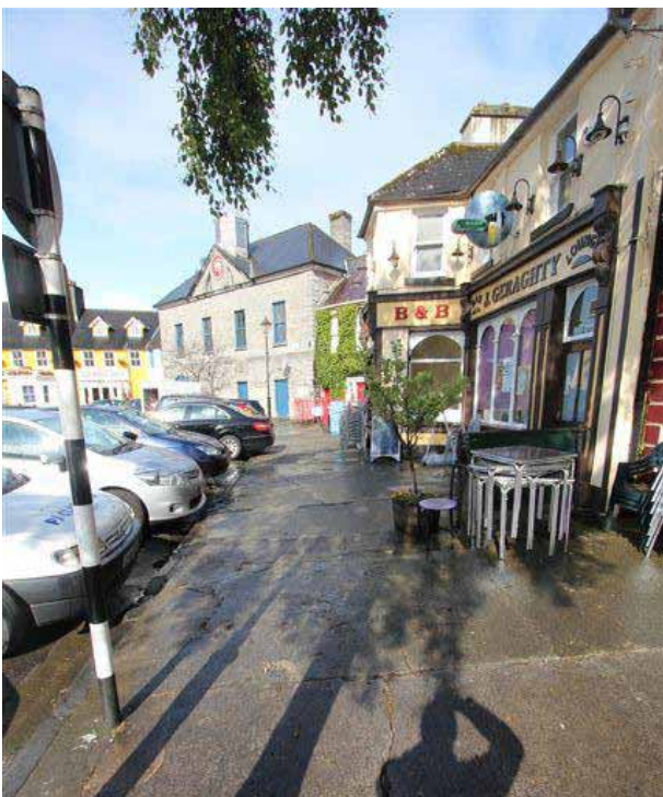
Figures 3.2 & 3.3 Improvements in the public realm, Westport, Co. Mayo