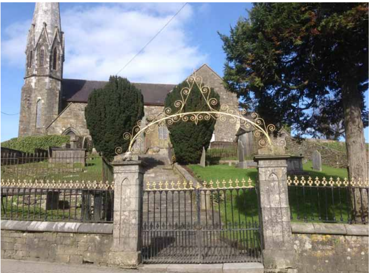
Figure 2.8 West Cork Heritage Centre

Fáilte Ireland, the Local Authority and the IWTN.