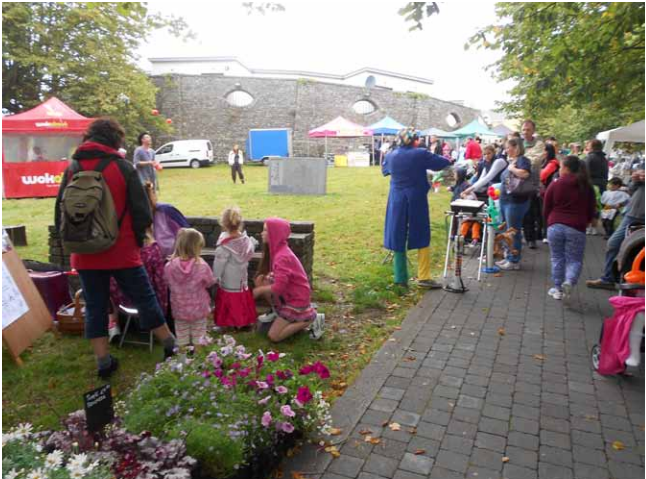
Figure 5.3 The Shambles Green being used for Walled Towns Day

Between Tobin's Lane and Emmet Row the group noticed how the area's attractive buildings were underappreciated due to the constant traffic engulfing the area. Landscaping, change of traffic flow and amended parking could all enhance this area. The Shambles Green should be redeveloped and made more family friendly (figure 5.3).