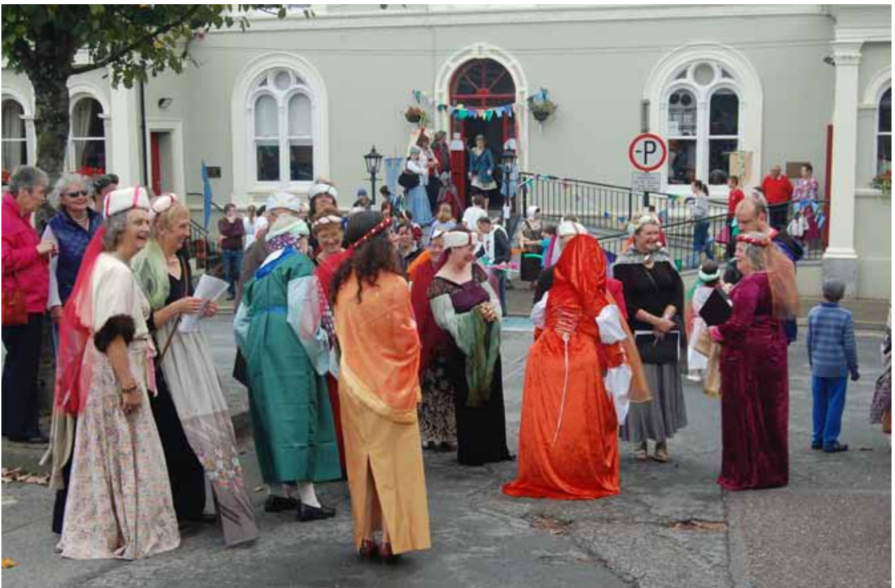
Carpark in front of Town Hall being used for Walled Towns Day