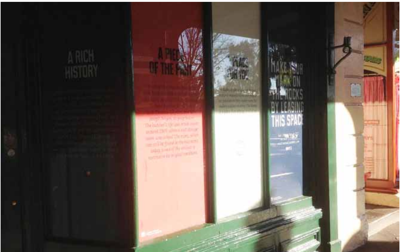
Vacant shop units in the Rocks, Sydney are elegantly dressed so as to add to the streetscape and encourage new lease holders