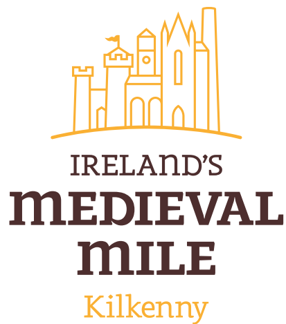
Figure 3.1 Kilkenny's medieval mile brand