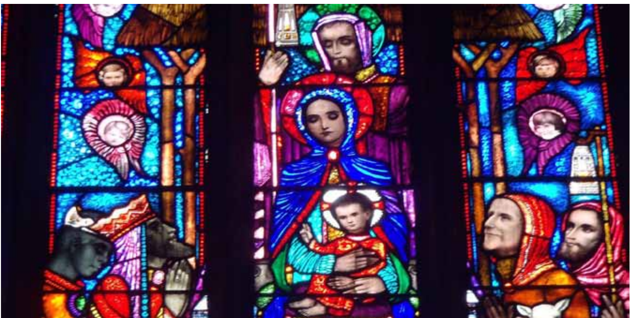
Stained glass, St Patrick's Church